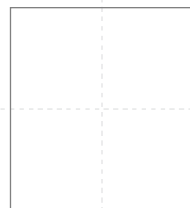
Step 1: Cut out around outline

This PDF is designed to fit in your camera carrying case. Simply print it out, then trim and fold along the lines to create your very own handy reference guide.